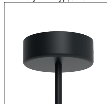
CMB ceiling mounting base